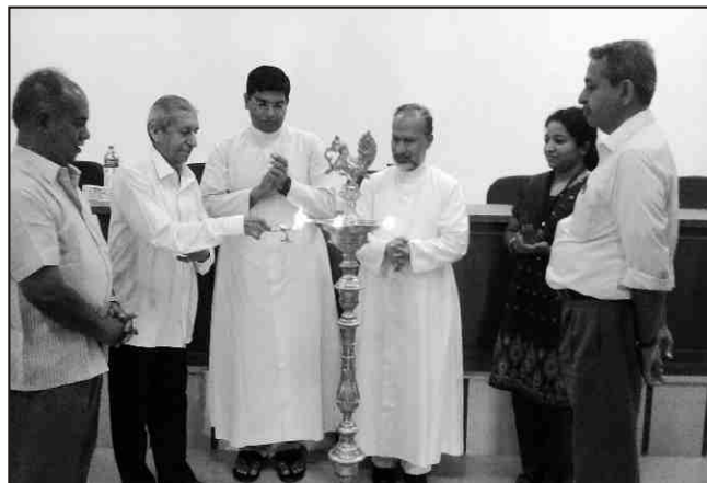
Inauguration of the National Seminar organised by ACBI Kerala Chapter