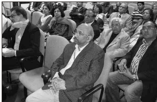
A part of the audience