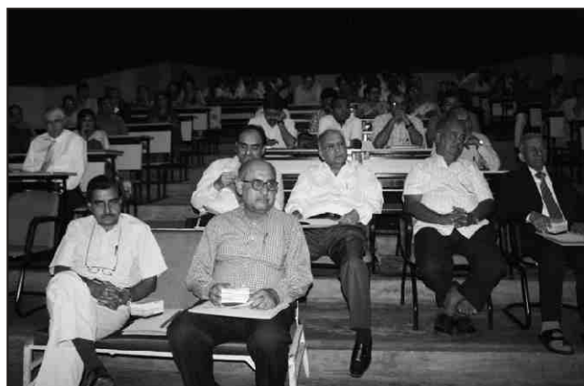
Part of the august audience