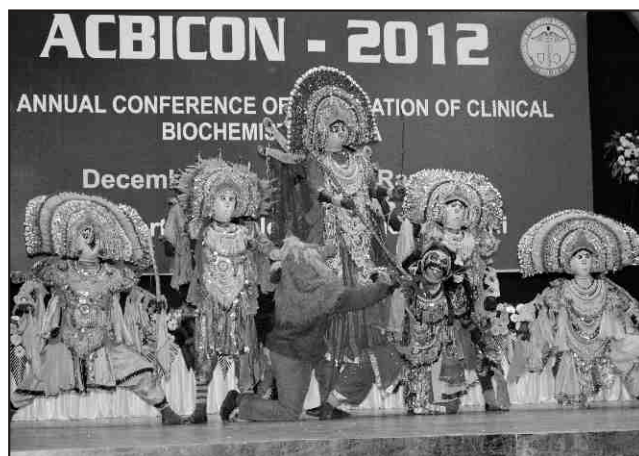
Chau dance presentation