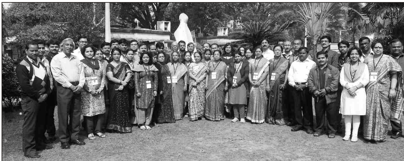
Participants of 4-day Quality Management System & Internal Auditors Training Programme organised by ACBI East Zone