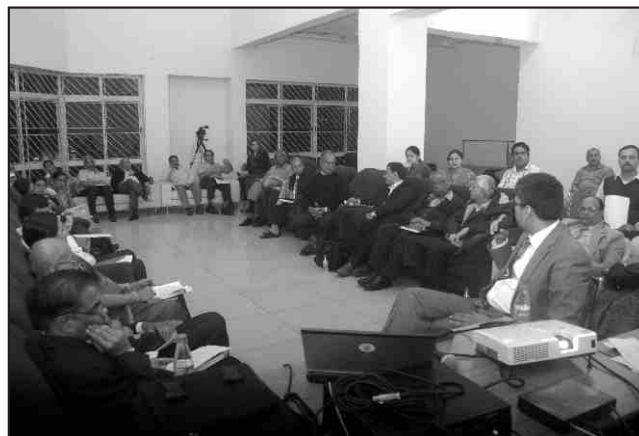
A view of the Pre-GB Executive Council Meeting