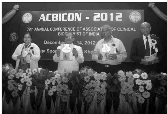
Release of the Conference Souvenir

The Conference was officially inaugurated on 12th Dec