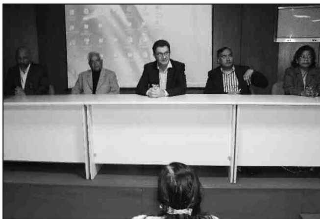
Symposium organised by ACBI Delhi Chapter

The Department of Biochemistry, Chacha Nehru Bal Chikitsalya (CNBC) in association with Association of Clinical Biochemists of India (ACBI)-Delhi Chapter organized a one day Symposium on Dec 15, 2012 in Delhi. This symposium aimed at creating awareness about the changing environment of medical laboratories and to bring both Laboratory Scientists and Clinicians at the same platform. Over 100 healthcare professionals from across the country attended this symposium to know about emerging trends in Laboratory Medicine and the current and future developments in the field of Inborn errors of metabolism. The meet was held at Chacha Nehru Bal Chikitsalya, pioneer in specialised pediatric health services associated to Maulana Azad Medical College. This hospital is the first public hospital in India to get accreditation from National Accreditation Board for Health Care Providers.