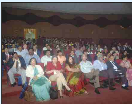
Inaugural Function : A part of audience