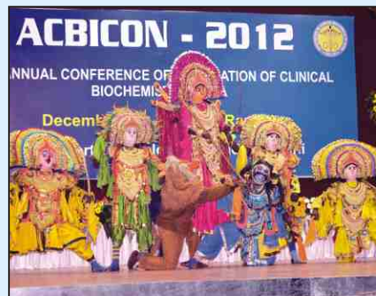
Colourful Chau Dance : Inaugural Function