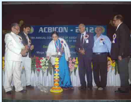
Lighting the ceremonial lamp : inauguration of the ABICON, 2013