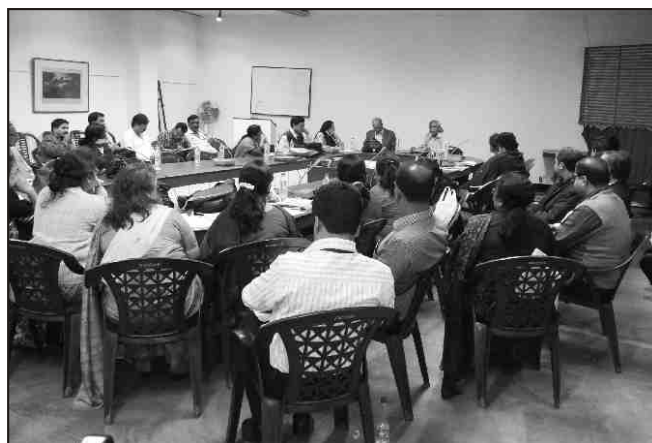
ACBI East Zone : Quality Management System & Internal Auditors Training Programme in progress

A Research Workshop on Inborn Errors of Metabolism & Metabolic Disorders was organized by the Department of Biochemistry, College of Medicine & JNM Hospital, WBUHS, Kalyani on March 7-8, 2013, in association with International Union of Biochemistry & Molecular Biology