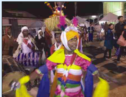
A colourful & traditional welcome of delegates in inaugural session