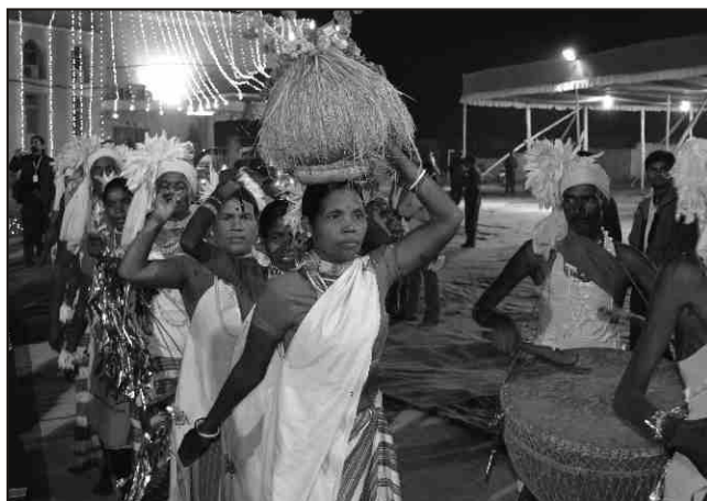
Colourful welcome of delegates during the Inaugural Session